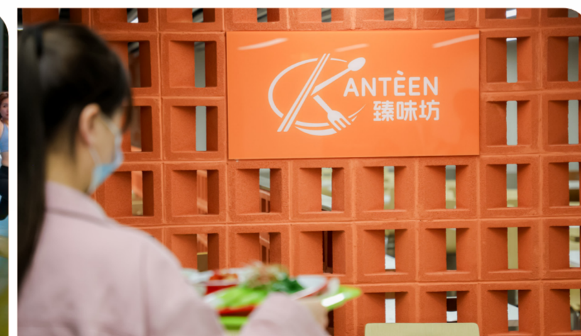
◆ KANTEEN, the Newly Upgraded Canteen