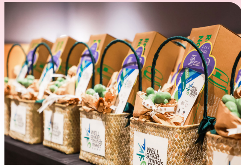
◆ WELL the Great Minds Meet

Reinforcing its role as a platform for connection, JAKC partnered with the International WELL Building Institute (IWBI) to launch “WELL the Great Minds Meet”. This initiative brings together stakeholders to explore the intersection of healthy spaces, businesses and lifestyles.