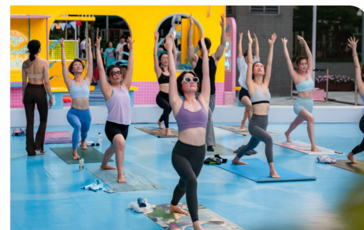
◆ Sports and Exercise Classes

Further strengthening social connections, the KINETIC photography contest encouraged office professionals to embrace work-life balance. The initiative attracted over a hundred submissions and generated thousands of online engagements, reflecting strong community participation.