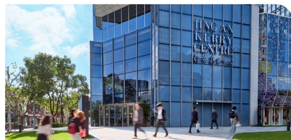
◆ Shanghai Jing An Kerry Centre

Building on the success of WELL initiatives at Shenzhen Qianhai Kerry Centre and Beijing Kerry Centre, “WELL the Great Minds Meet” demonstrates our continued commitment to wellness-led placemaking.