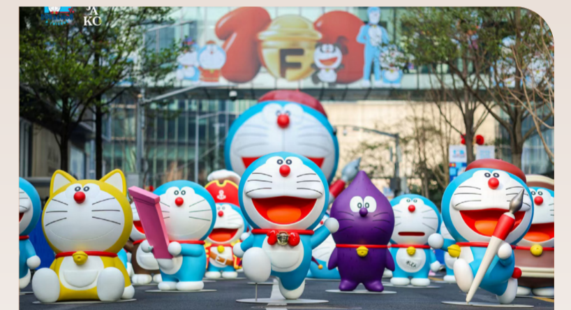
◆ The Exhibition Attracted Thousands of Visitors

Silver Award for Innovation in Consumer Events