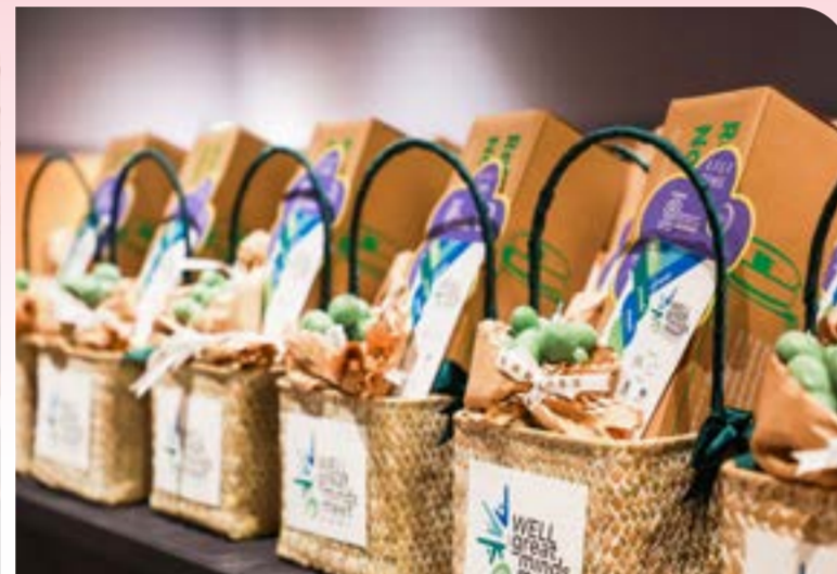
◆ WELL the Great Minds Meet

Reinforcing its role as a platform for connection, JAKC partnered with the International WELL Building Institute (IWBI) to launch “WELL the Great Minds Meet”. This initiative brings together stakeholders to explore the intersection of healthy spaces, businesses and lifestyles.