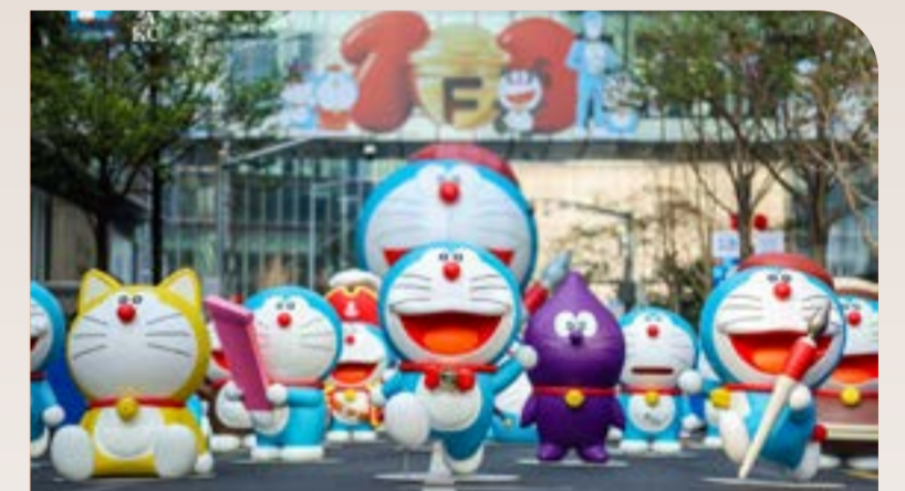
◆ The Exhibition Attracted Thousands of Visitors

Silver Award for Innovation in Consumer Events