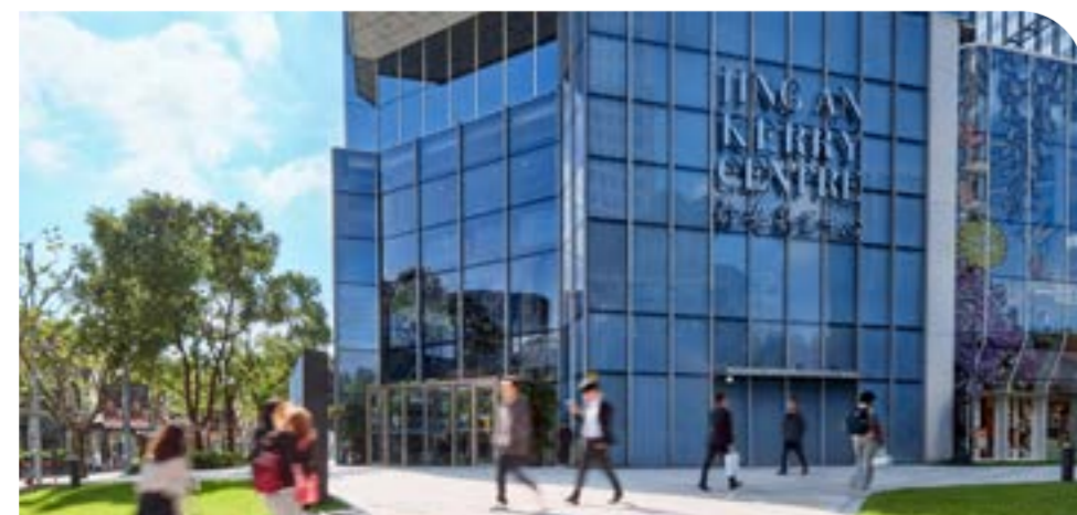
◆ Shanghai Jing An Kerry Centre

Building on the success of WELL initiatives at Shenzhen Qianhai Kerry Centre and Beijing Kerry Centre, “WELL the Great Minds Meet” demonstrates our continued commitment to wellness-led placemaking.