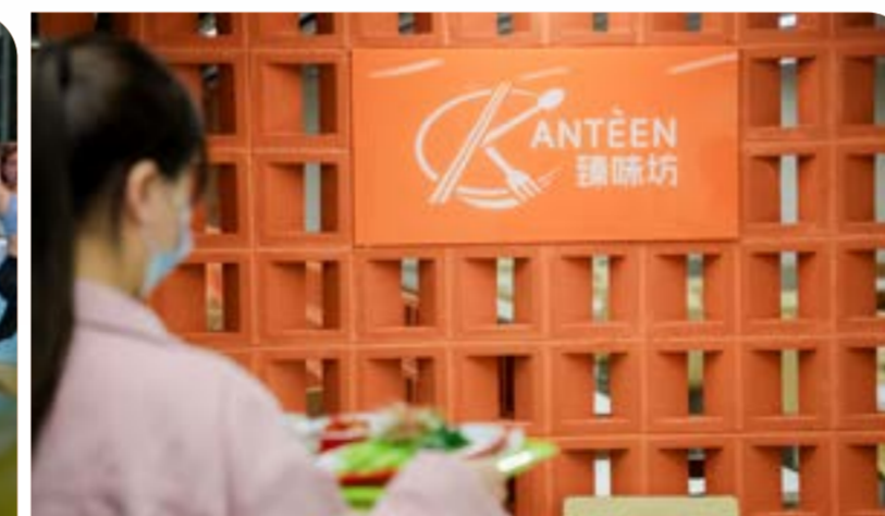
◆ KANTEEN, the Newly Upgraded Canteen