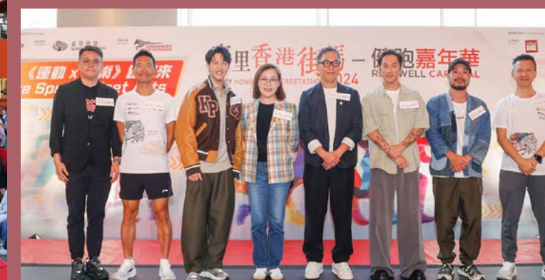
Run Well Carnival at Hong Kong MegaBox