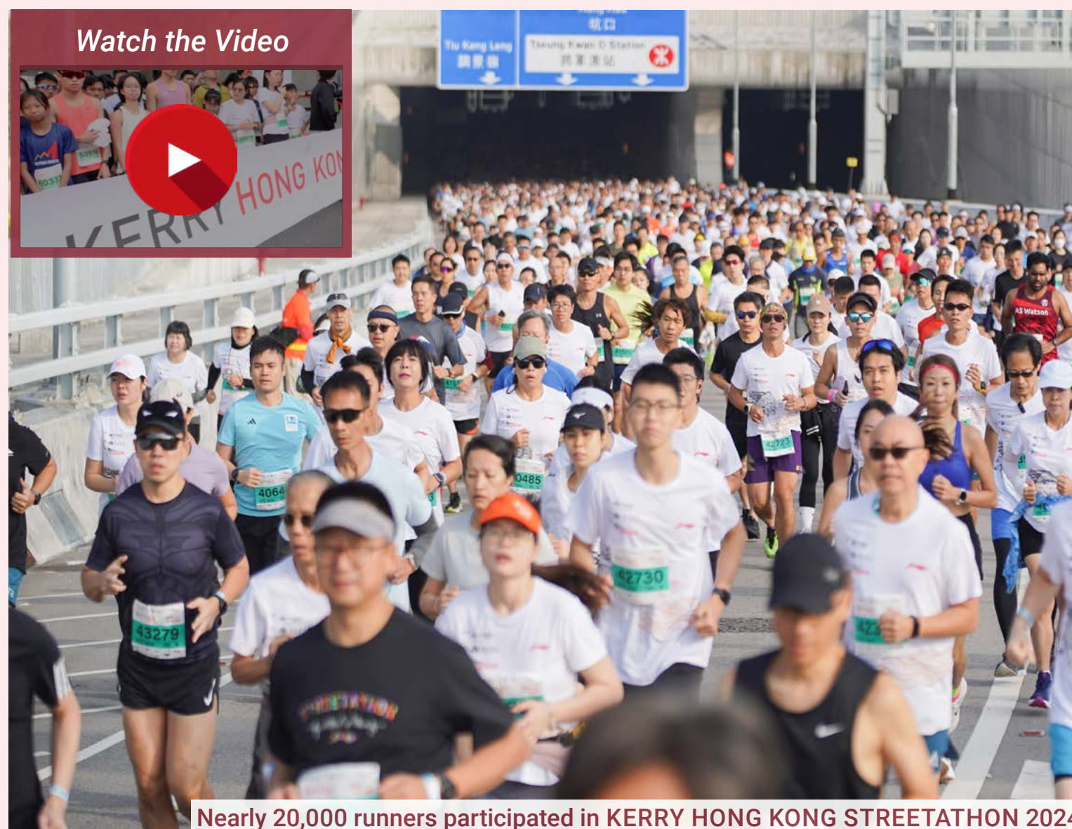
Nearly 20,000 runners participated in KERRY HONG KONG STREETATHON 2024